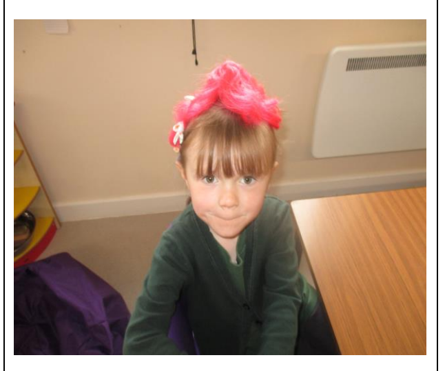
Great ideas. Very funny!